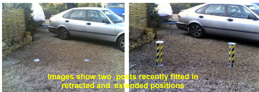
Images show two posts recently fitted in retracted and extended positions

These post can be supplied for your own installation or we will be happy to provide a quote for installation by our own team.